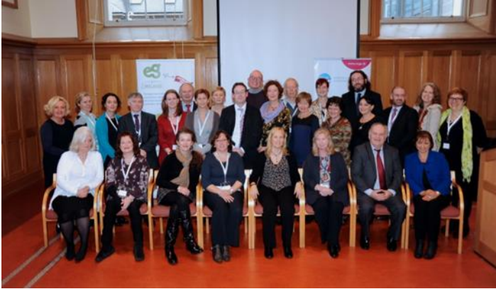
National Forum attendees – December 2015

95% interested in continued participation in the Forum discussions etc.