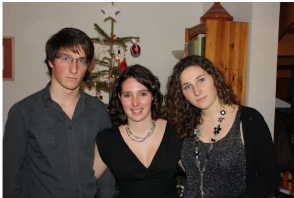
My children at Christmas